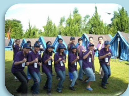
Camp Officers with 1 st Semarang Trainees.

The message was "Don't mess with us, leaders. We're tough!"