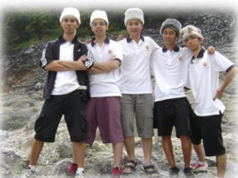
2nd BB Asia Academy in 2008

I appreciate The BB ministry even more when I participated in the 2 nd BB Asia Academy in Jakarta in 2008. There I began to understand the vastness of the BB work when I met, share and work with my fellow BB members from the different countries in Asia.