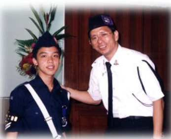
Awarded Best Boy in 1998

surprise, I was honoured with The Best Boy award in 1998. By then I became the editor of my company newsletter until 2003. I was later promoted to Staff Sergeant in 2000. After returning from my studies in Australia, I continued to serve as an officer with my company.