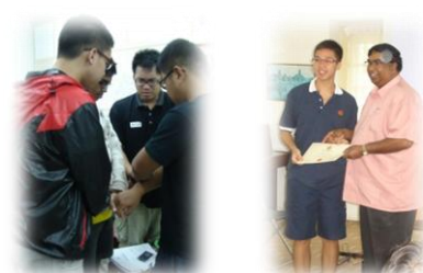
1 st FTWC in 2010

I was blessed to be selected to attend BB Asia's 1st Full Time Workers conference held in August this year. It was a privilege not just to visit BB Asia's new office but also to attend the dedication service.