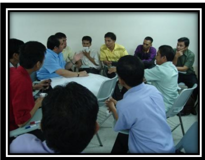
BOTC Trainees in discussion

After having five (5) road shows promoting BB and two (2) Basic Officers Training Courses (BOTC) conducted over a period of 9 months (January – September 2010) we finally saw three (3) new BB companies incorporated in July 2010. Another three (3) confirmed BB companies would be incorporated officially between October and November