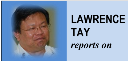
LAWRENCE TAY reports on