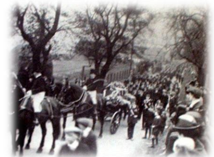
The Procession of our Founder's funeral in 1914

Sir William Alexander Smith died on Sunday 10th of May 1914. He was buried in the Western Necropolis in Glasgow where thousands followed the funeral procession.