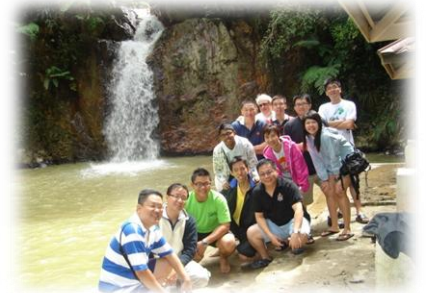
Jeriau Falls outing