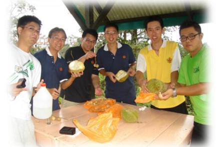
A time for fellowship

At the end of the workshop, all agreed that it is worth to organise this conference once in every two years.