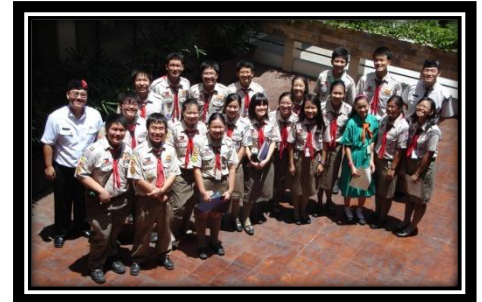
LDC Trainees from GCC

providing all the facilities, manpower and logistics support in promoting the BB ministry in the Philippines.