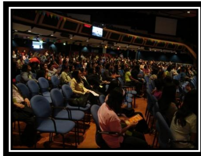
About 1000 educators at the IFL Convention.