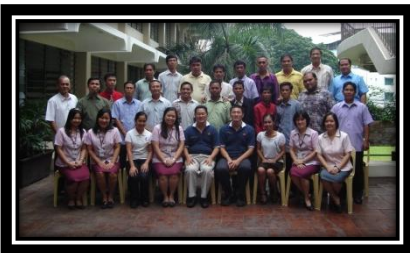
Group Photo of BOTC Trainees

The last two visits on July 7-12, 2010 and September 1-8, 2010 respectively have been most encouraging.